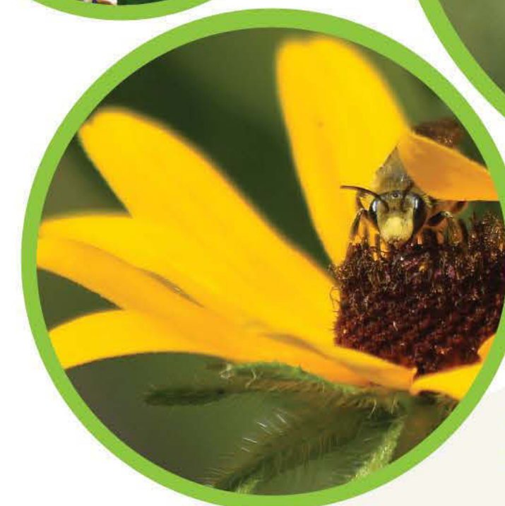
Honeybee on black-eyed Susan