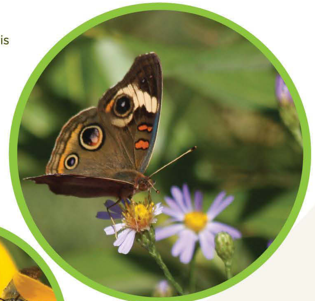
Buckeye butterfly on aromatic aster