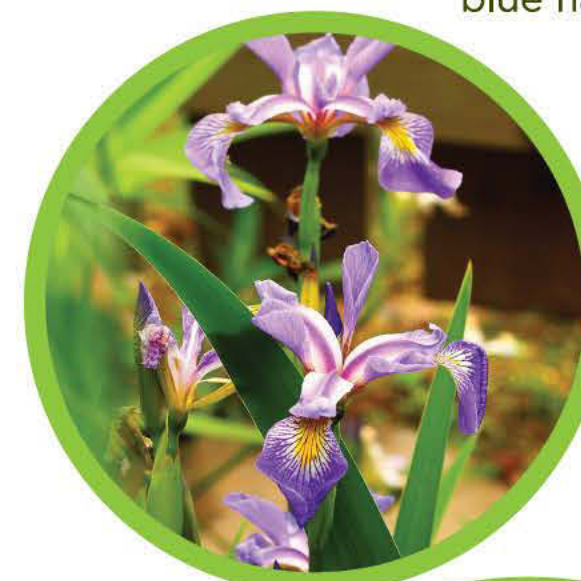
Southern blue flag iris