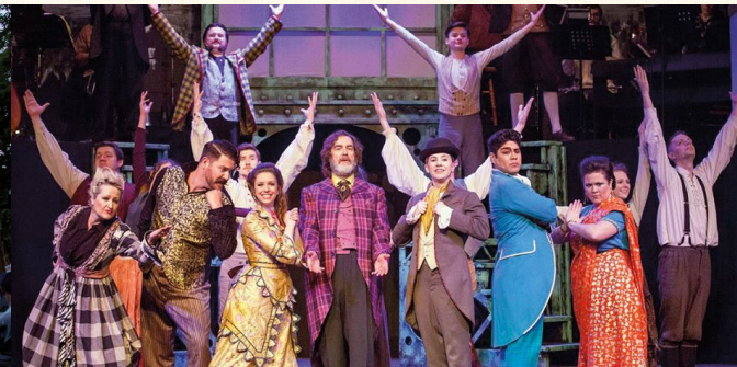
©2017 SCGD/Studio X 10/17 Design, Cover and Interior Food and Product Photos: studiox.us